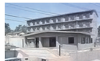
International House on Tobata campus