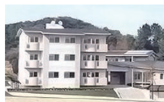
International House on Iizuka campus

Each room of International House is equipped with a kitchen, refrigerator, bed or beds, and other furniture. It has a seminar room, a lounge, and a laundry room for common use. The period of residence is, in principle, no more than 6 months in order to secure rooms for new students.