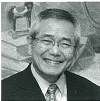
Purdue University Distinguished Professor Mr. Ei-ichi Negishi (Teijin Group Distinguished Fellow) 5th year Teijin kumura scholarship (1957)

*This message was contributed in November 2013.